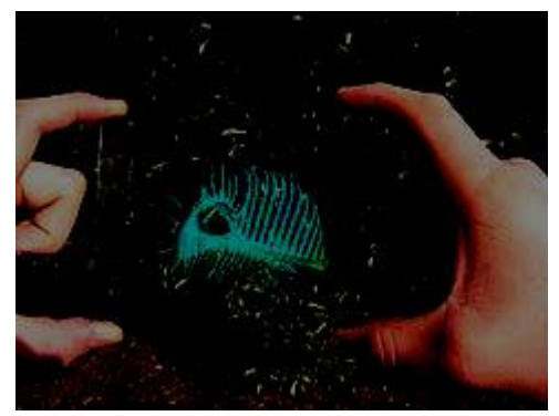
Ultimate 08, laser 532nm, hologram H2