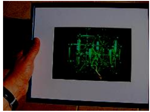
Ultimate 08, laser 532nm, hologram Denisyuk