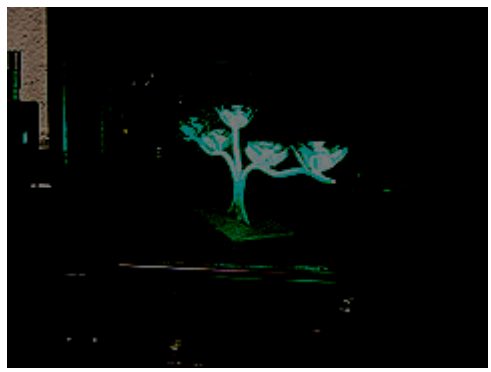
Ultimate 08, laser 532nm, transmission hologram H1

Don't hesitate to share your results and observations with us!